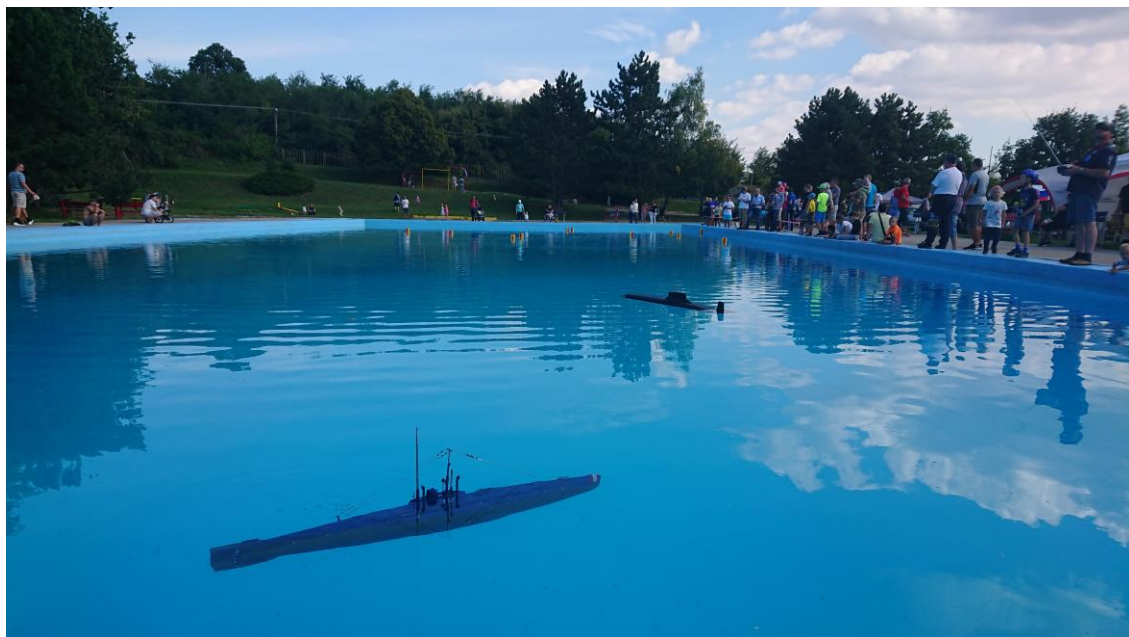
Place of Event: Swimming pool Bratislava - Rača